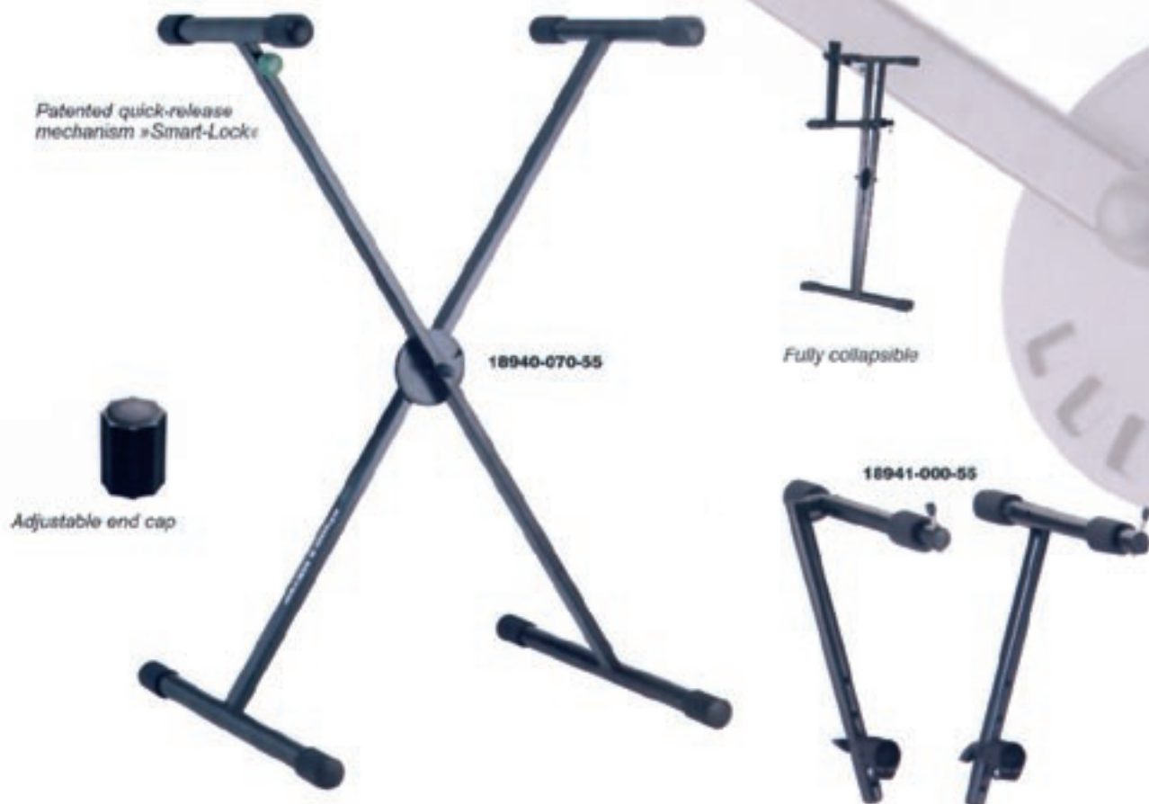
Patented quick-release mechanism »Smart-Lock«