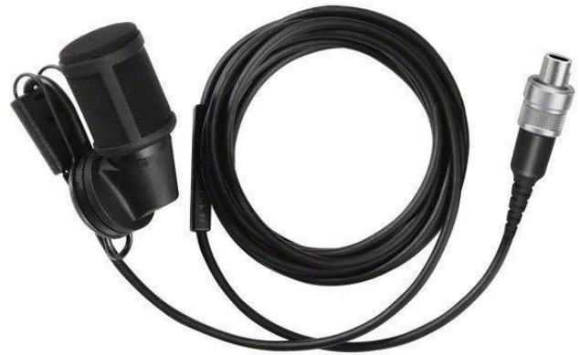
MKE 40 (Black 3-Pin)

The MKE 40 is a high-quality, clip-on microphone for every area of live sound transmission. Its consistent pick-up pattern (cardioid) ensures high feedback rejection and excellent acoustic performance under challenging on-stage conditions. It sets the highest benchmarks in sound quality and robustness under tough on-stage conditions.