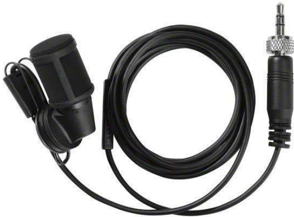
MKE 40 (Black EW)