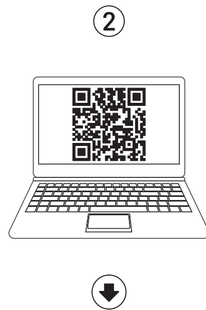
Download & Install Control Software https://www.sennheiser.com/control-cockpit-software