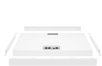
SL CM EB Article No. 508528 Extension Brackets