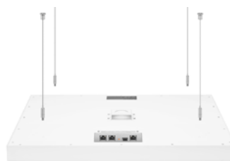
SL CM SK Article No. 508291 Suspension Kit