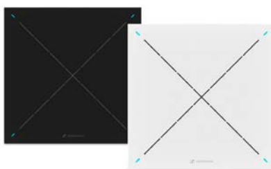
TeamConnecti Ceiling 2 White Article No. 507488 TeamConnecti Ceiling 2 Black Article No. 509161