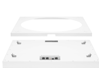
SL CM FB Article No. 5068446 Mounting Frame